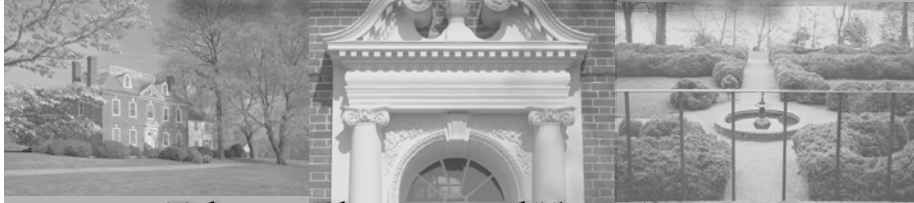
Tidewater Plantation and Nature Preserve