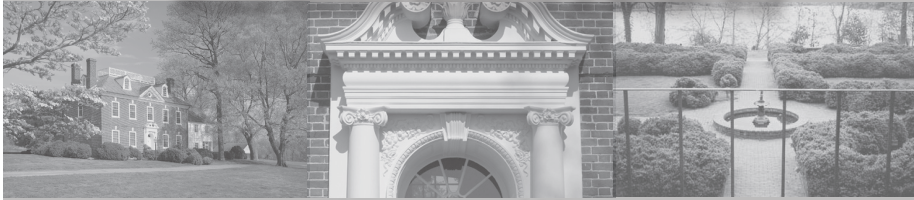
Tidewater Plantation and Nature Preserve