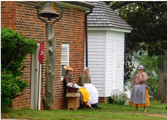
Members of the 4th Legionary Corps brought history to life for opening weekend in May.