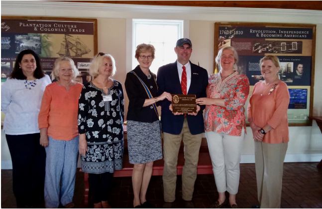
The National Society of Colonial Dames Ann Arrundell Chapter awarded special plaque honoring Mount Harmon as important historic site.